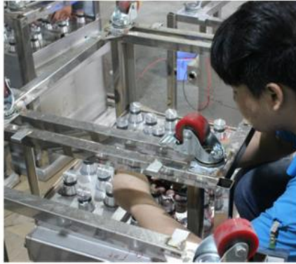
② product assembling