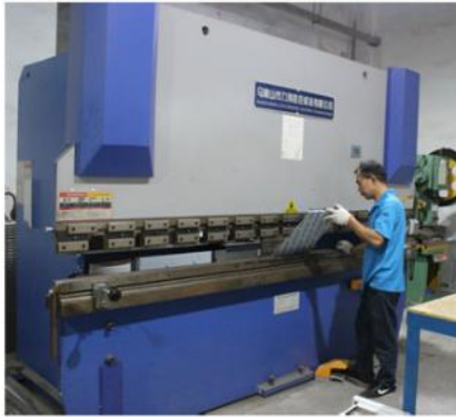
① material processing