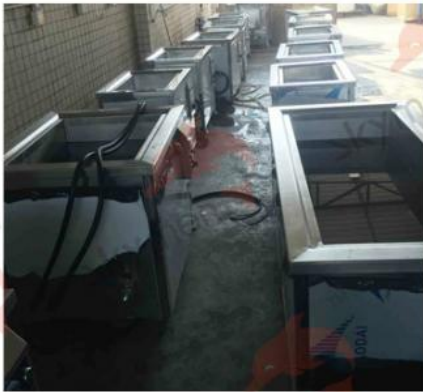
③ product test