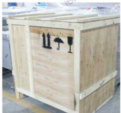
⑥ wooden case