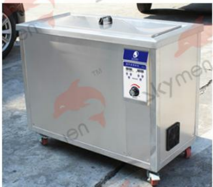
④ finished product