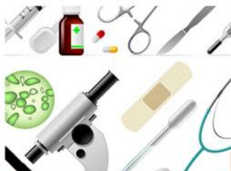
Dental Hospital Instrument